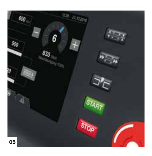
The five hard keys from top to bottom: Open and close belt drive Manual feeder Zero-cut Start production Stop production

The lota 330 is ready for use after pressing the 'Power On' button. The material to be cut is clamped in place according to the closing distance and applied pressure settings of the belt drive. The product length, number of pieces and batch size can be set via the touchscreen. The desired end product can be verified using the sample function, and the machine can then be started. Five buttons serving as hard keys for the most common operations, along with the touch display, enable simple handling and quick changeover for a wide range of materials without the use of any tools.