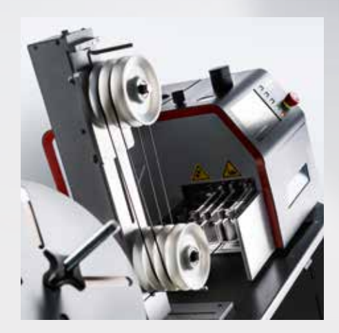
left Possible prefeeder